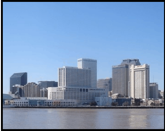
New Orleans Skyline