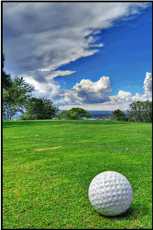
The Lakewood Golf Course