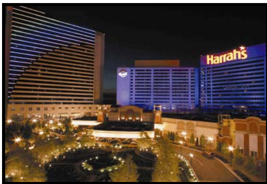
Harrah's at Night

A Four-Diamond Treasure in the Centre of Town... InterContinental New Orleans enjoys one of the city's most coveted locations: two blocks from the French Quarter, four blocks from Harrah's New Orleans, and six blocks from the riverfront. The hotel has a health club, outdoor swimming pool and a lobby lounge with a perfect view of the tram changing down St. Charles Avenue, along with a comfy chair and smooth cocktail and you're set for a lazy New Orleans afternoon.