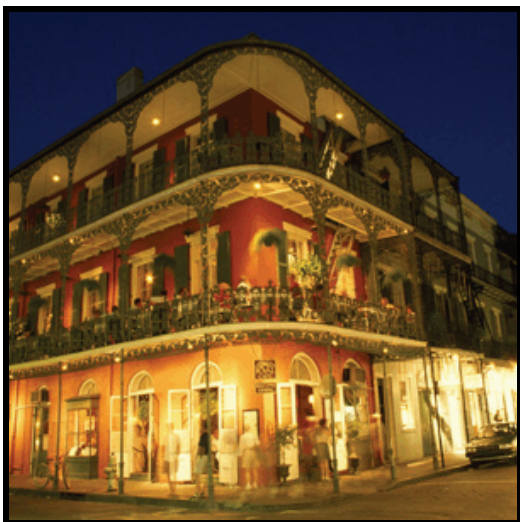
The French Quarter

Saturday evening will be an evening of entertainment and networking. All the details have not been ironed out but I hope you like Hurricanes and Jazz music. You'll have to come see for yourself how this plays out. As is our tradition, we will hold the President's Banquet Monday night. New Orleans offers so much to do so there will be plenty of time after dinner to explore the French Quarter. If you are a new member and don't have plans, just hang out in the lobby and there will many groups who just plan to walk to Bourbon Street or around Jackson Square and will be glad to invite you along. We are known as the "friendly bunch" for a reason!